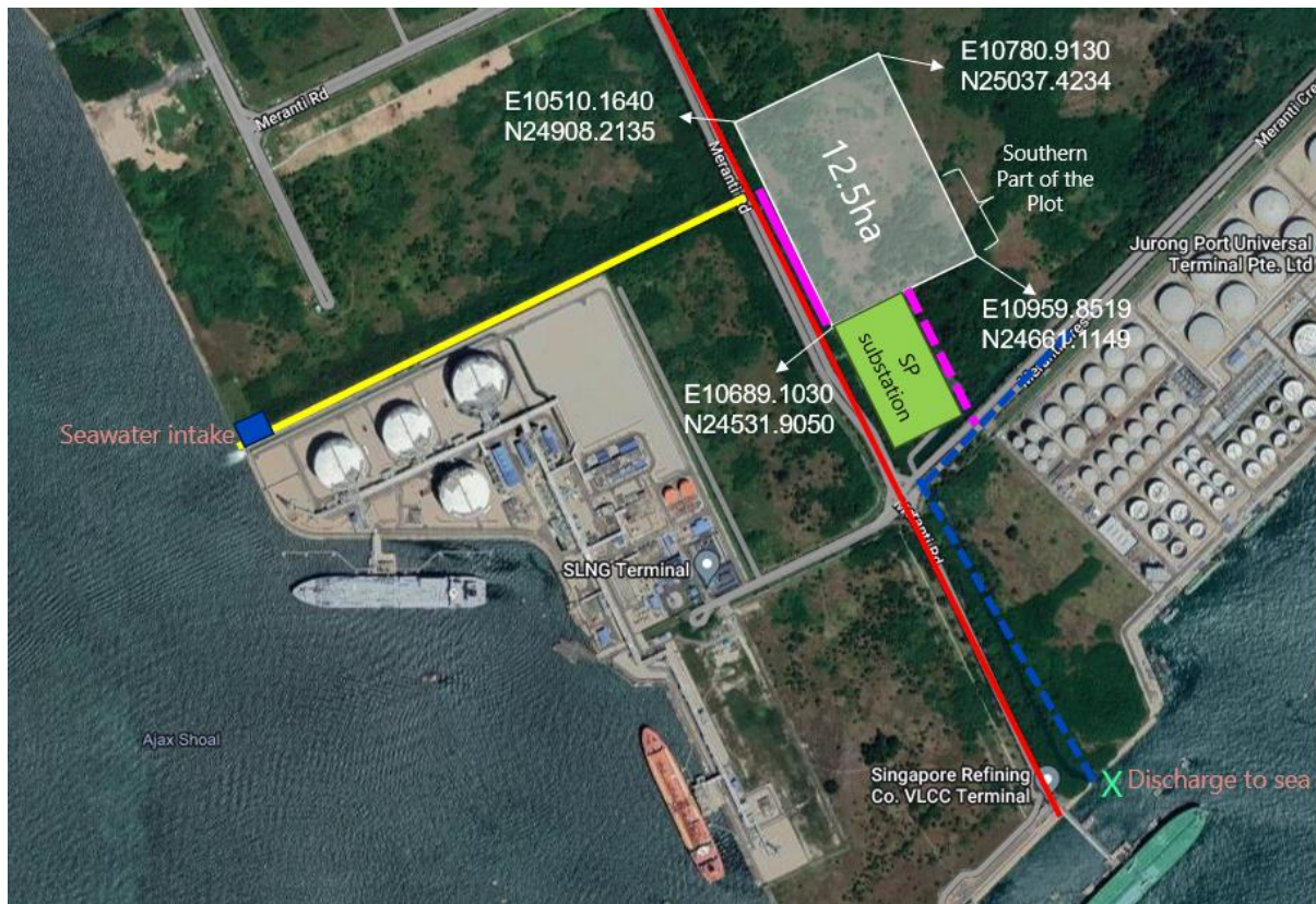
Figure 2: Location of EMA's Identified Greenfield Site